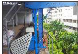
Mini Lift 1.5 Ton