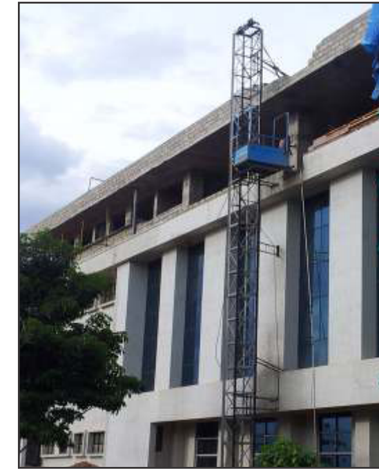
Material Handling Lift