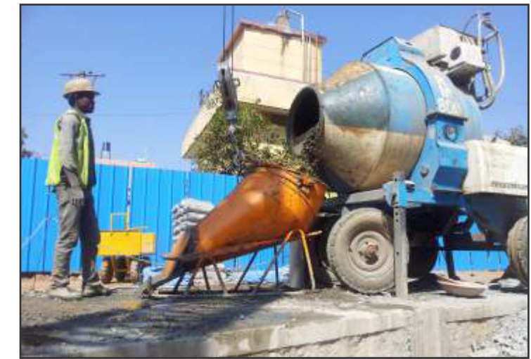
RM - 800 Digital Weigh Batch Mixer 12 Cubic Meter/hr