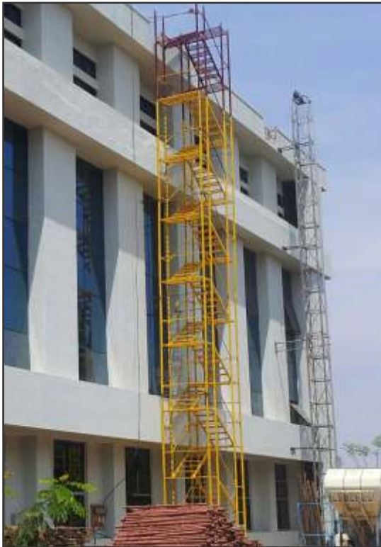
Mild steel stairs for worker access