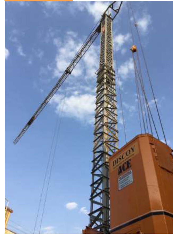
Mobile Crane : SEC 2500