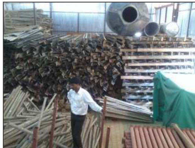
Godown & Storage Facility