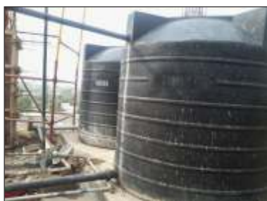
Curing Facility at sites