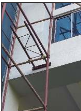
Specilised steel clamps to hold scaffolds in position