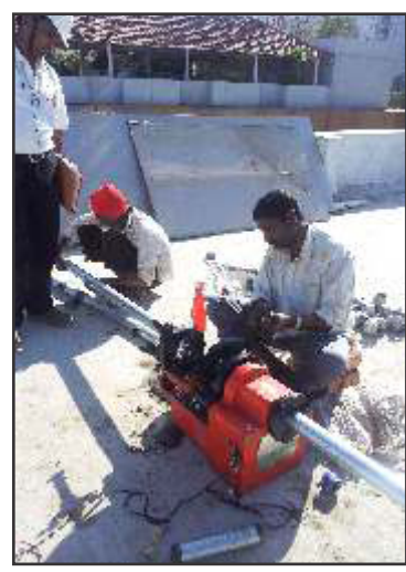
GI Threading Machine