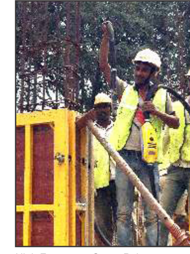
High Frequency Smart Poker 40MM - 12000 rpm 400 W