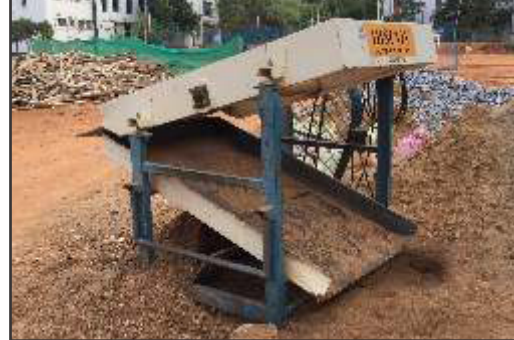
Sand Sieving Machine