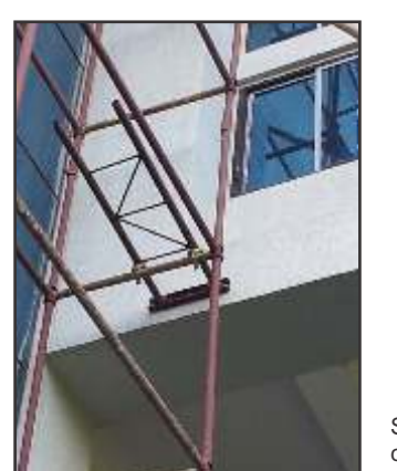
Specilised steel clamps to hold scaffolds in position